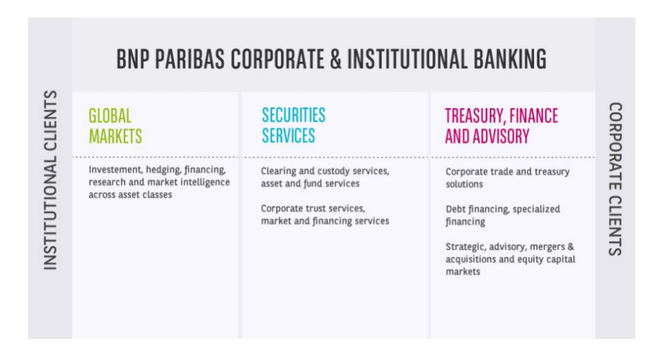
Graph 1: Corporate Structure (Source: Website of BNP Paribas)

BNP Paribas organizes its business into two main fields of activity: Retail Banking & Services (RBS), and Corporate Institutional Banking (CIB). The RBS business is divided into "Domestic Markets" and "International Financial Services". The other business field, CIB, is a global provider of financial solutions to corporate and institutional clients. The main business activities in the CIB are as follows: